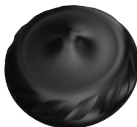
Acupoint massage head