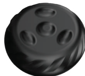
Wave Massage Head