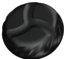
Ring Massage Head