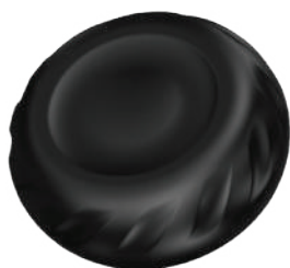
Flat Press Grinding Head