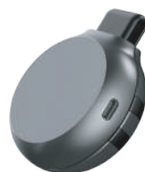
Magnetic Wireless Charger